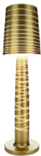
ACCESSORY FIND Serralunga Lady Jane lamp, $3,205; mobilimobel.com